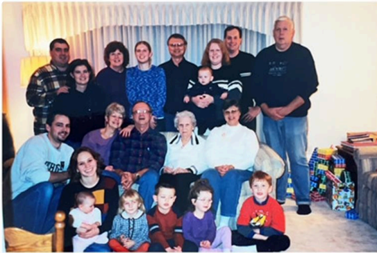
PhotoScan by Google Photos